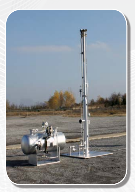
MJ Flare System